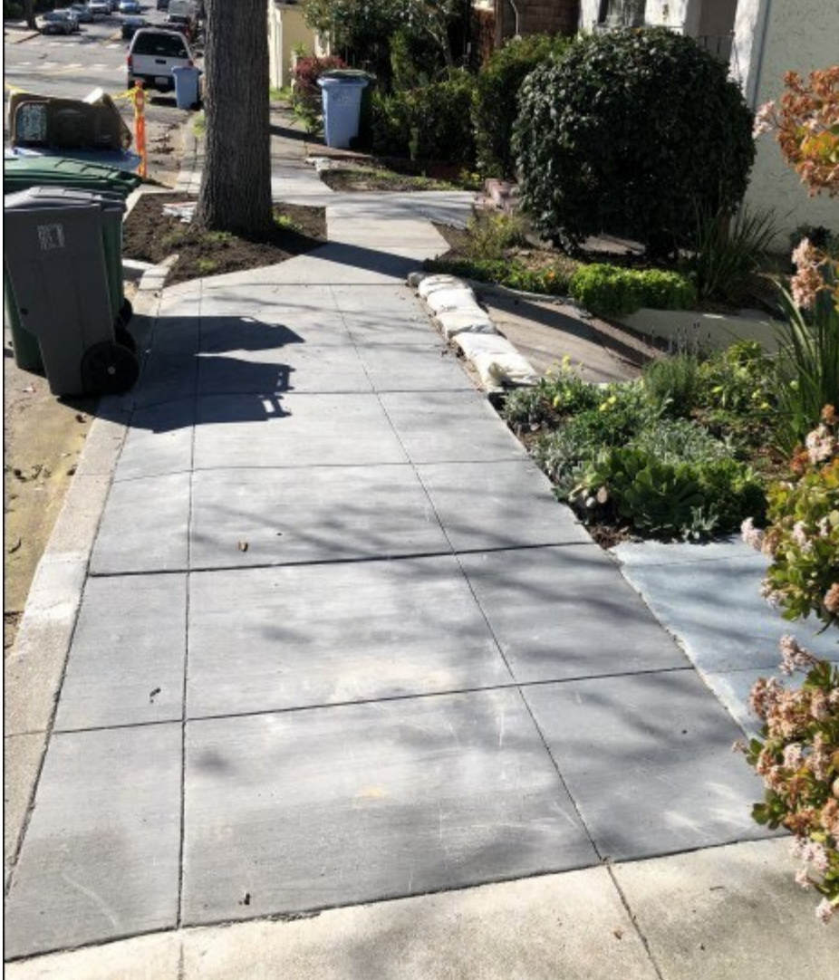
Sidewalk Repair Photo

Sidewalk Repair Project is underway and is scheduled for completion in the Spring of 2024. This project includes about 575 locations.