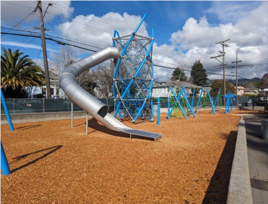
Grove Park Play Structure Ages 5-12

Please join us for a Ribbon Cutting to celebrate the newly renovated Grove Park Playground for ages 2-5 and 5-12 and picnic area on March 6th at 3:00 pm. Light refreshments will be provided.