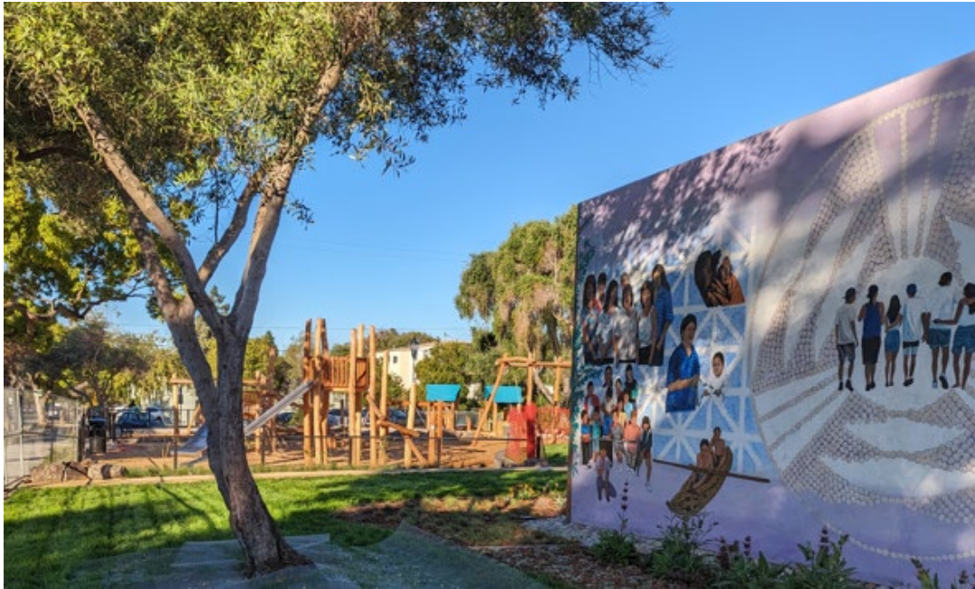
Ohlone Park Mural Garden

Several months ago, Ohlone Park (above North Berkeley Senior Center) 2-5 and 5-12 play structures opened. The Mural Garden and turf area will be open to the public as of March 6, 2024. When the artwork associated with the mural is finished and installed, there will be a community celebration.