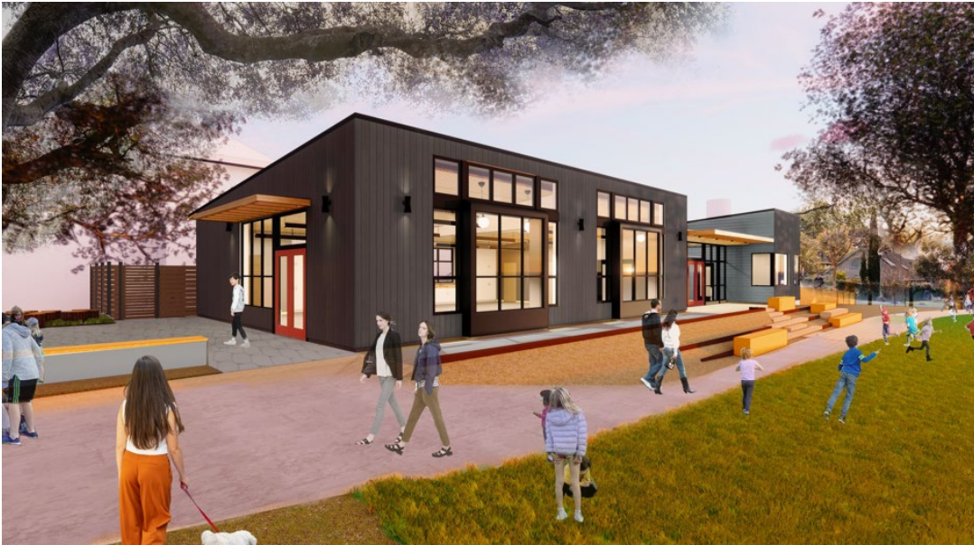
Willard Park Clubhouse and Restroom Replacement rendering

Construction is set to begin in mid-March and completed before the summer of 2025.